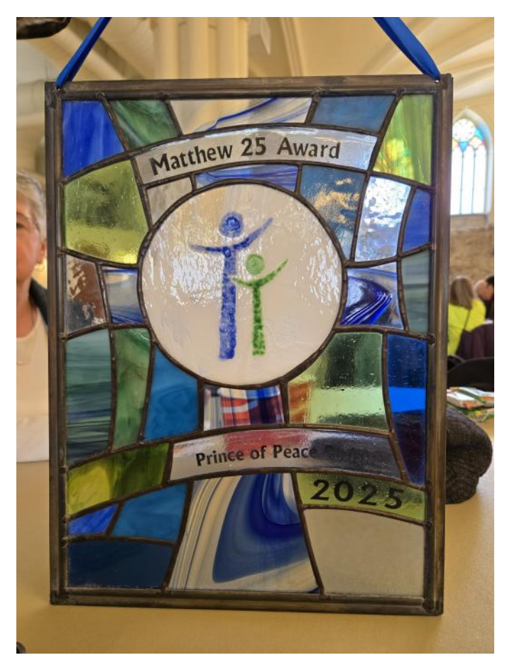
Matthew 25 Award

The parish plans to use money from the Matthew 25 Award to add a heating element and a small refrigerator to the food truck, so they will have the option of delivering hot meals in the winter and chilled water and beverages in the summer.